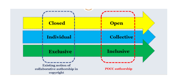
Fig IV: POCC as a new archetype of collaborative authorship

57 Therefore, the notion of POCC authorship presents a new archetype of collaborative authorship that is open, collective and inclusive. The existing exclusivity-based copyright law that is founded upon the conventional closed, individualistic notion of collaborative authorship does not have the capacity to give legal expression to the inclusivity that is inherent in the relationships among the authors of a POCC work. Nor can it adequately capture the dynamism of the POCC work and the temporal dimension of rights of authorship over the evolving POCC work.